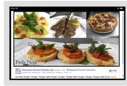
Link to Web-Sites / Homepage