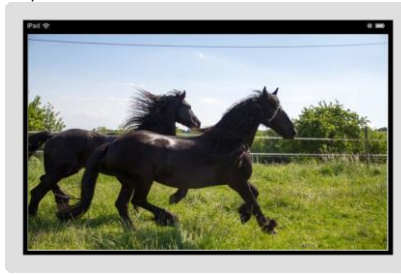
Playing of MPG4 Videos